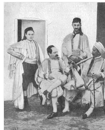
Jews of Tunisia, c. 1900.

In 1948, approximately 105,000 Jews lived in Tunisia. [91] About 1,500 remain today, mostly in Djerba , Tunis , and Zarzis . Following Tunisia's independence from France in 1956 emigration of the Jewish population to Israel and France accelerated. [91] After attacks in 1967, Jewish emigration both to Israel and France accelerated. There were also attacks in 1982, in 1985 following Israel's Operation Wooden Leg , [92][93] and most recently in 2002 when a bombing in Djerba took 21 lives (most of them German tourists) near the local synagogue, a terrorist attack claimed by Al-Qaeda .