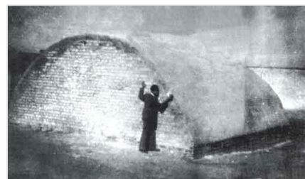
A mass grave of victims of the Farhud , 1941.

In 1948, there were approximately 150,000 Jews in Iraq. The community was concentrated in Baghdad and Basra .