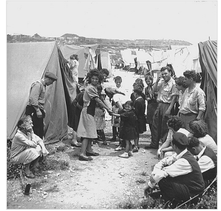
Jewish refugees at a Ma'abarot transit camp, 1950

The House of Representatives resolution was sponsored by Jerrold Nadler , who followed the resolutions in 2012 with House Bill H.R. 6242 ( https://www.congress.gov/bill/112th-congress/house-bill/6242 ). The 2007–08 resolutions proposed that any "comprehensive Middle East peace agreement to be credible and enduring, the agreement must address and resolve all outstanding issues relating to the legitimate rights of all refugees, including Jews, Christians and other populations displaced from countries in the Middle East", and encourages President Barack Obama and his administration to mention Jewish and other refugees when mentioning Palestinian refugees at international