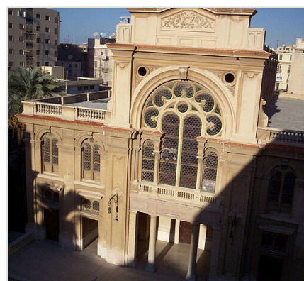
Eliyahu Hanavi Synagogue in Alexandria, Egypt