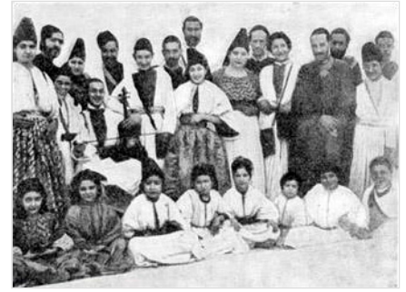
Jews of Fes , c. 1900

In 1955, a mob broke into the Jewish mellah in Mazagan (known today as El Jadida ) and caused its 1,700 Jewish residents to flee to the European quarters of the city. The houses of some 200 Jews were too badly damaged during the riots for them to return. [60] In 1954, Mossad had established an undercover base in Morocco, sending agents and emissaries within a year to appraise the situation and organize continuous emigration. [61] The operations were composed of five branches: self-defense, information and intelligence, illegal immigration, establishing contact, and public relations. [62] Mossad chief Isser Harel visited the country in 1959 and 1960, reorganized the operations, and created a clandestine militia named the "Misgeret" ("framework"). [63]