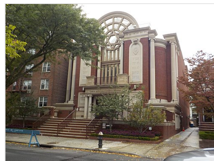
An Egyptian synagogue in the United States

1,000 Jews were arrested and 500 Jewish businesses were seized by the government. A statement branding the Jews as "Zionists and enemies of the state" was read out in the mosques of Cairo and Alexandria. [179][180] Jewish bank accounts were confiscated and many Jews lost their jobs. Lawyers, engineers, doctors and teachers were not allowed to work in their professions. Thousands of Jews were ordered to leave the country and told that they may be sent to concentration camps if they stayed. [179] They were allowed to take only one suitcase and a small sum of cash, and forced to sign declarations "donating" their property to the Egyptian government. Foreign observers reported that members of Jewish families were taken hostage, apparently to insure that those forced to leave did not speak out against the Egyptian government. Jews were expelled or left, forced out by the anti-Jewish feeling in Egypt. [181] Some 25,000 Jews, almost half of the Jewish community left, mainly for Europe, the United States, South America and Israel, after being forced to sign declarations that they were leaving voluntarily, and agreed with the confiscation of their assets. Similar measures were enacted against British and French nationals in retaliation for the invasion. By 1957 the Jewish population of Egypt had fallen to 15,000.