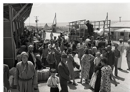
Iraqi refugees in a ma'abara , April 1951.