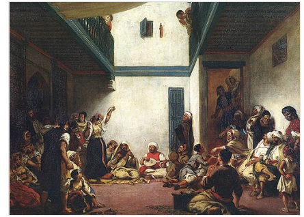
Jewish Wedding in Morocco by Eugène Delacroix, Louvre, Paris, 1839

In Morocco, the Vichy regime during World War II passed discriminatory laws against Jews; for example, Jews were no longer able to get any form of credit, Jews who had homes or businesses in European neighborhoods were expelled, and quotas were imposed limiting the percentage of Jews allowed to practice professions such as law and medicine to no more than two percent. [45] King Mohammed V expressed his personal distaste for these laws, assuring Moroccan Jewish leaders that he would never lay a hand "upon either their persons or property". While there is no concrete evidence of him actually taking any actions to defend Morocco's Jews, it has been argued that he may have worked on their behalf behind the scenes. [46][47]