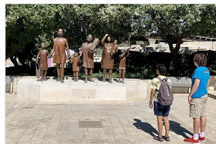
Jewish Departure and Expulsion Memorial from Arab Lands and Iran on the Sherover Promenade, Jerusalem