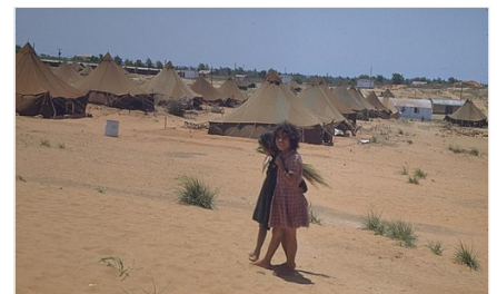
Yemenite Jewish refugee children in front of Bet Lid camp. Israel, 1950

The majority of Jews in Arab countries eventually immigrated to the modern State of Israel. [296] Hundreds of thousands of Jews were temporarily settled in the numerous immigrant camps throughout the country. Those were later transformed into ma'abarot (transit camps), where tin dwellings were provided to house up to 220,000 residents. The ma'abarot existed until 1963. The population of transition camps was gradually absorbed and integrated into Israeli society. Many of the North African and Middle-Eastern Jews had a hard time adjusting to the new dominant culture, change of lifestyle and there were claims of discrimination.