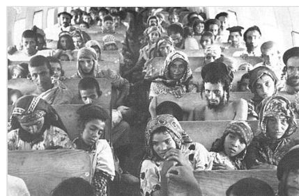
Yemenite Jews en route from Aden to Israel, during the Operation Magic Carpet (1949–1950)

In 1942, prior to the formulation of the One Million Plan , David Ben-Gurion described his intentions with respect to such potential policy to a meeting of experts and Jewish leaders, stating that "It is a mark of great failure by