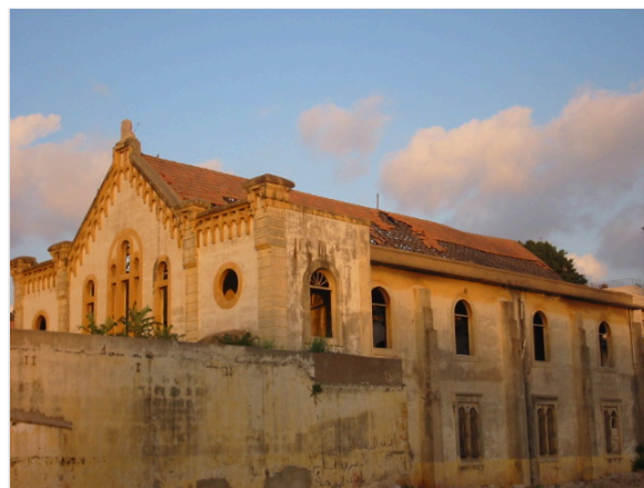
Maghen Abraham Synagogue in Beirut, Lebanon

In 1948, there were approximately 30,000 Jews in Syria. In 1949, following defeat in the Arab–Israel War, the CIA-backed March 1949 Syrian coup d'état installed Husni al-Za'im as the President of Syria. Za'im permitted the emigration of large numbers of Syrian Jews, and 5,000 left to Israel. [201]