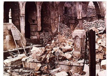
Ruins of the Central Synagogue of Aleppo after the 1947 Aleppo pogrom