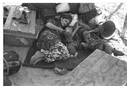
Iraqi Jews displaced 1951.