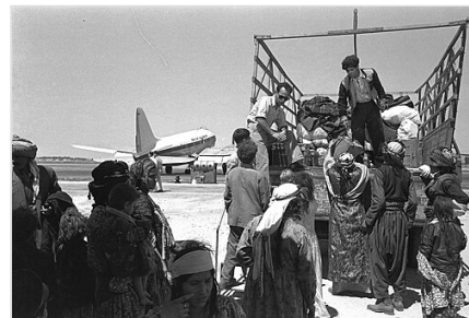
Iraqi Jews leaving Lod airport (Israel) on their way to ma'abara transit camp, 1951