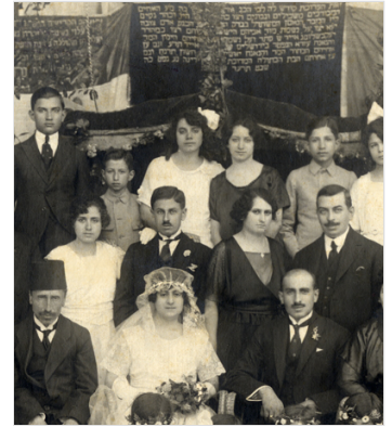
A Jewish wedding in Aleppo, Syria (Ottoman Empire), 1914.

The communities and localities affected included the Jerusalem Jewish Quarter , Hebron , Ein Tzurim , Masu'ot Yitzhak , Revadim , Beit HaArava , Kalya , Kfar Etzion , Atarot , Kfar Darom , Neve Yaakov , and Tel Or . [212][213]