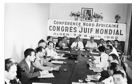
World Jewish Congress conference on the situation of Jews in North Africa, Algiers, 1952