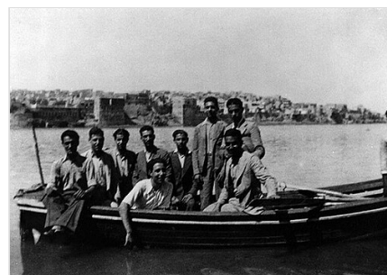
A group of young Iraqi Jews who fled to Palestine following the Farhud in Baghdad. They reached Palestine after considerable difficulties, including arrest, trial and imprisonment by the British authorities as well as deportation. 1941.